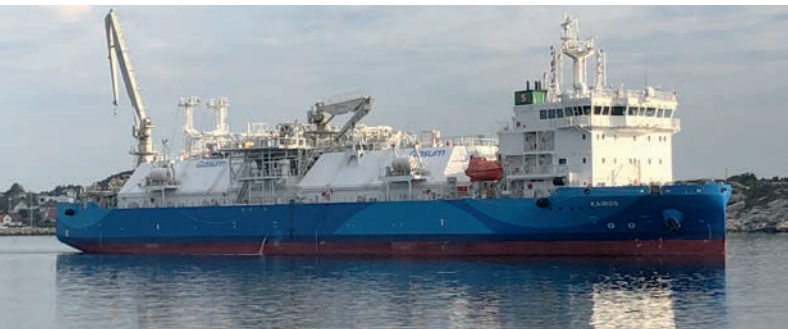
complexity of future bunkering